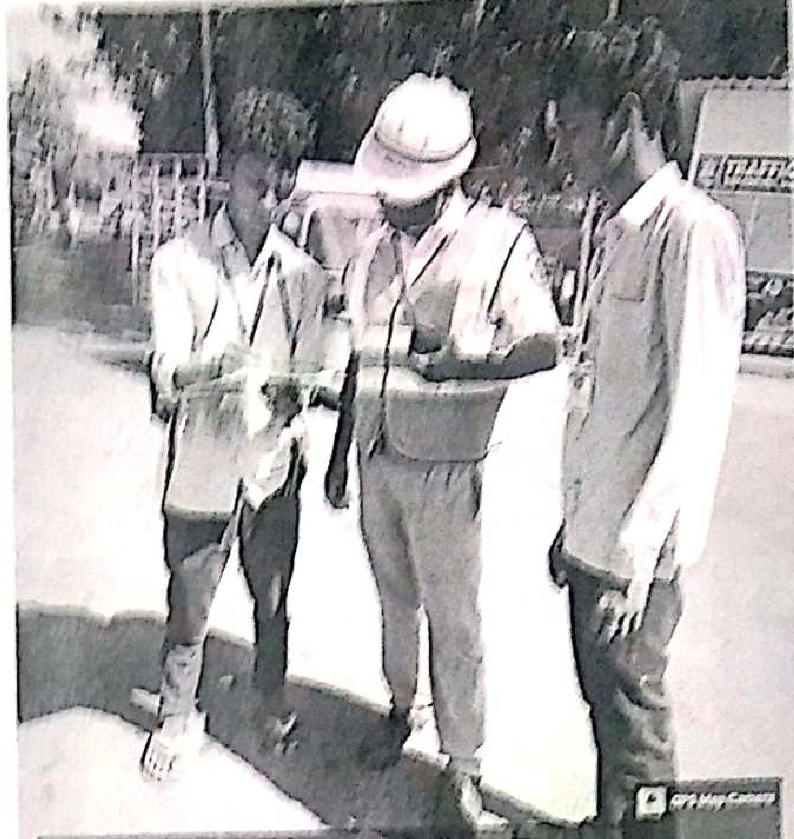
Visakhapatnam, Andhra Pradesh, भारत Annapurna Gardens, AP Pollution Control Board Rd, Vuda Layout, Medhavadhara, Visakhapatnam, Andhra Pradesh 530028, भारत Lat 17.752519° Long 83.244024° 28/09/22 02:01 PM GMT +05:30