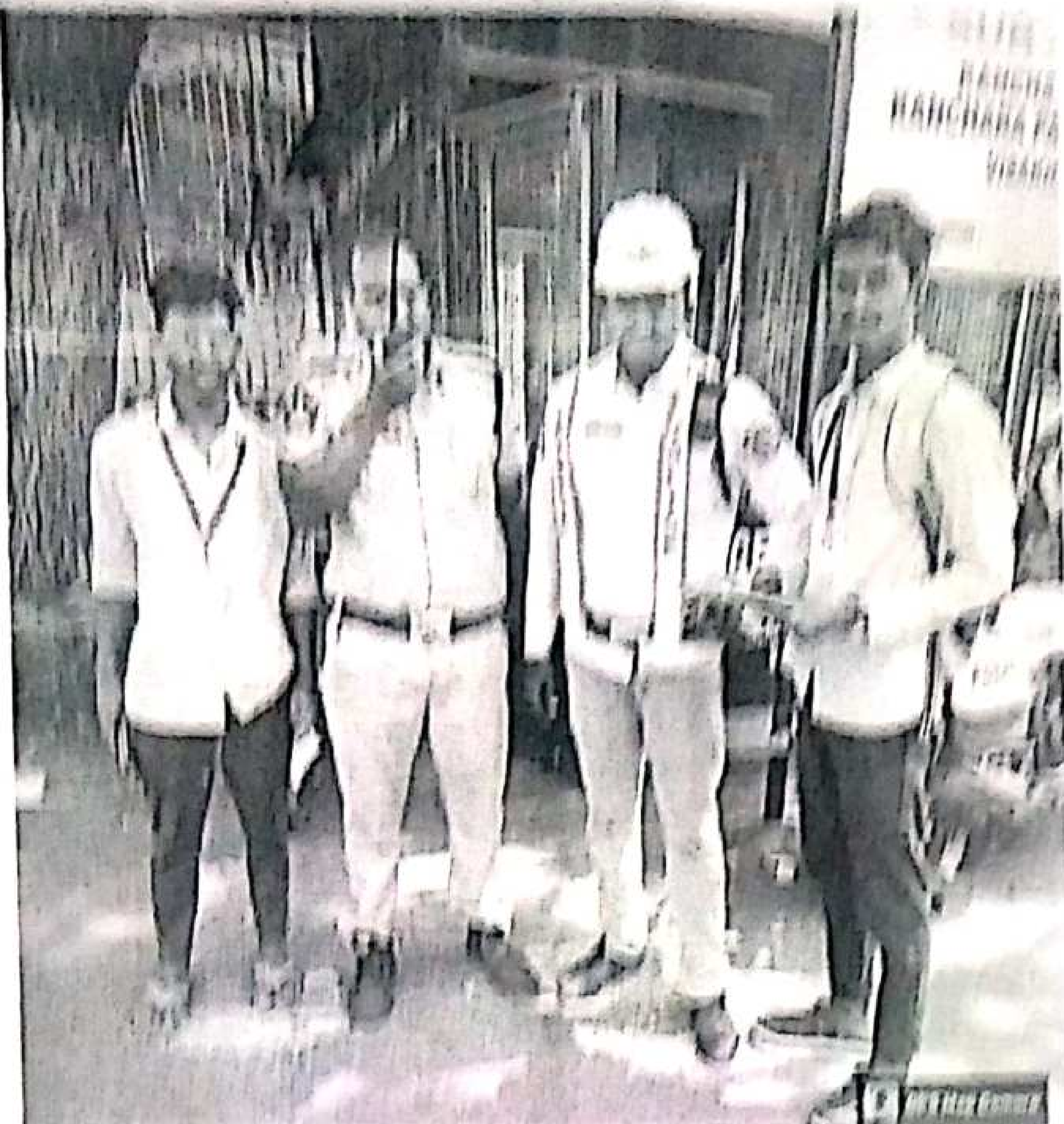
Visakhapatnam, Andhra Pradesh, भारत Annapurna Gardens, AP Pollution Control Board Rd, Vuda Layout, Medhavadhara, Visakhapatnam, Andhra Pradesh 530028, भारत Lat 17.752519° Long 83.244024° 28/09/22 01:02 PM GMT +05:30