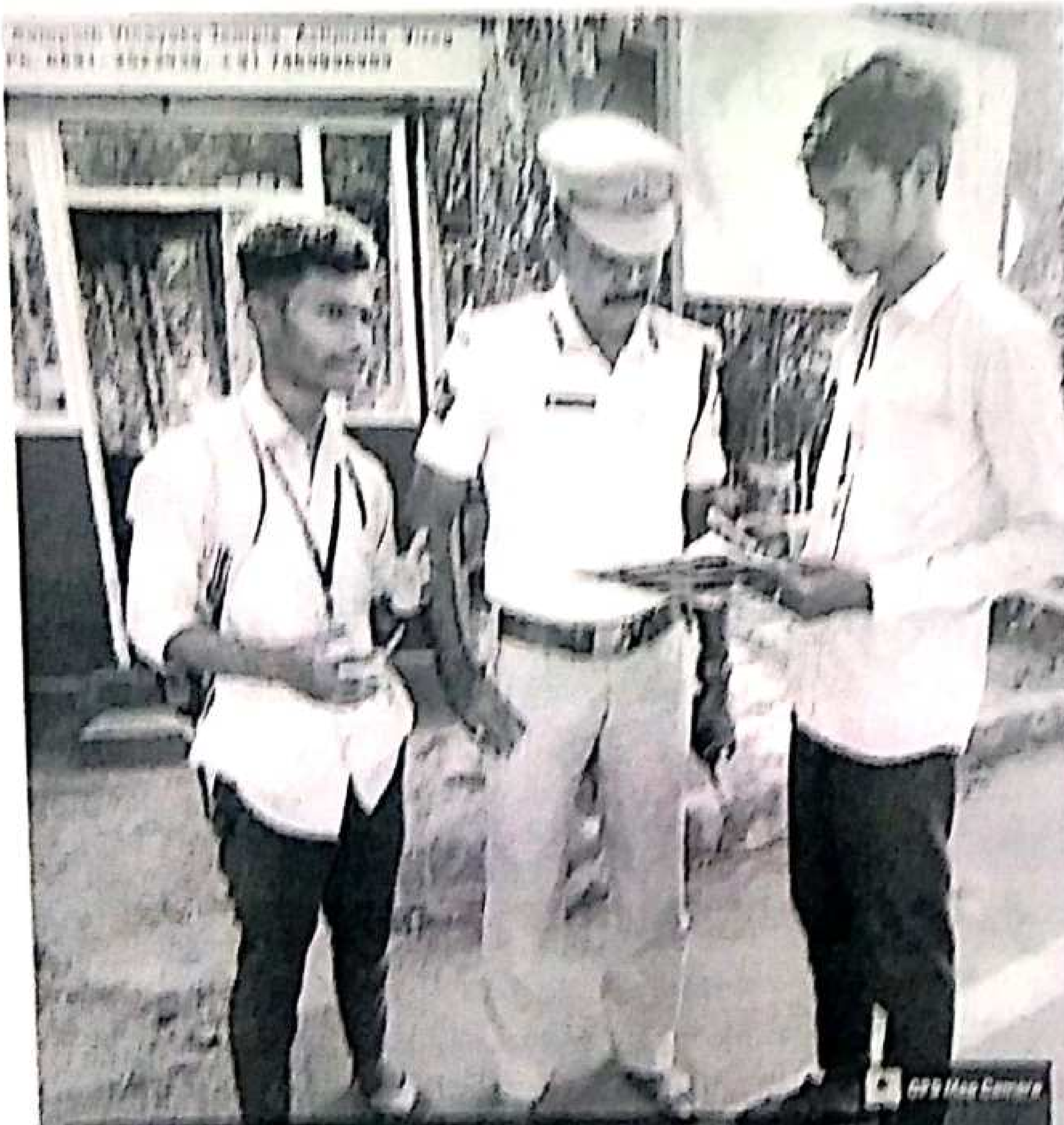
Visakhapatnam, Andhra Pradesh, भारत Annapurna Gardens, AP Pollution Control Board Rd, Vuda Layout, Medhavadhara, Visakhapatnam, Andhra Pradesh 530028, भारत Lat 17.752519° Long 83.244024° 28/09/22 02:57 PM GMT +05:30