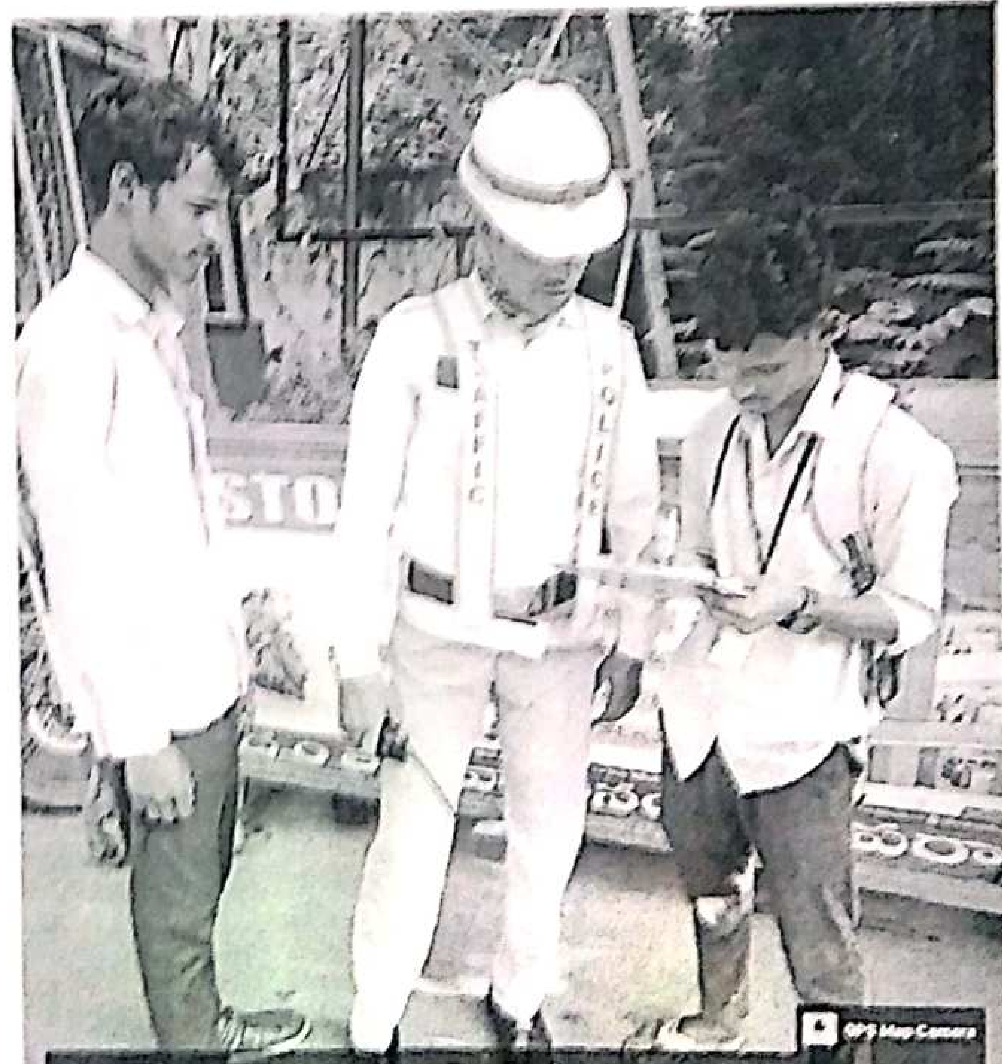
Visakhapatnam, Andhra Pradesh, भारत Annapurna Gardens, AP Pollution Control Board Rd, Vuda Layout, Medhavadhara, Visakhapatnam, Andhra Pradesh 530028, भारत Lat 17.752519° Long 83.244024° 28/09/22 03:10 PM GMT +05:30